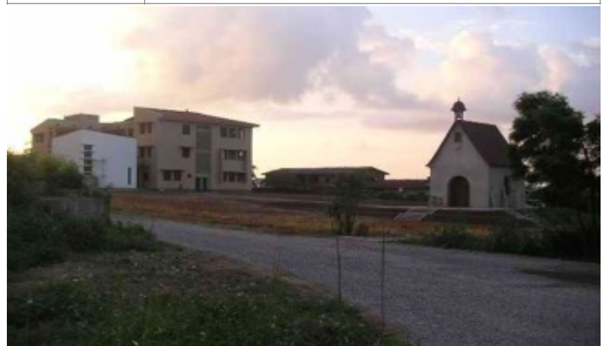
The Formation House and the Shrine at Ijokodo, Ibadan, Oyo State, Nigeria.