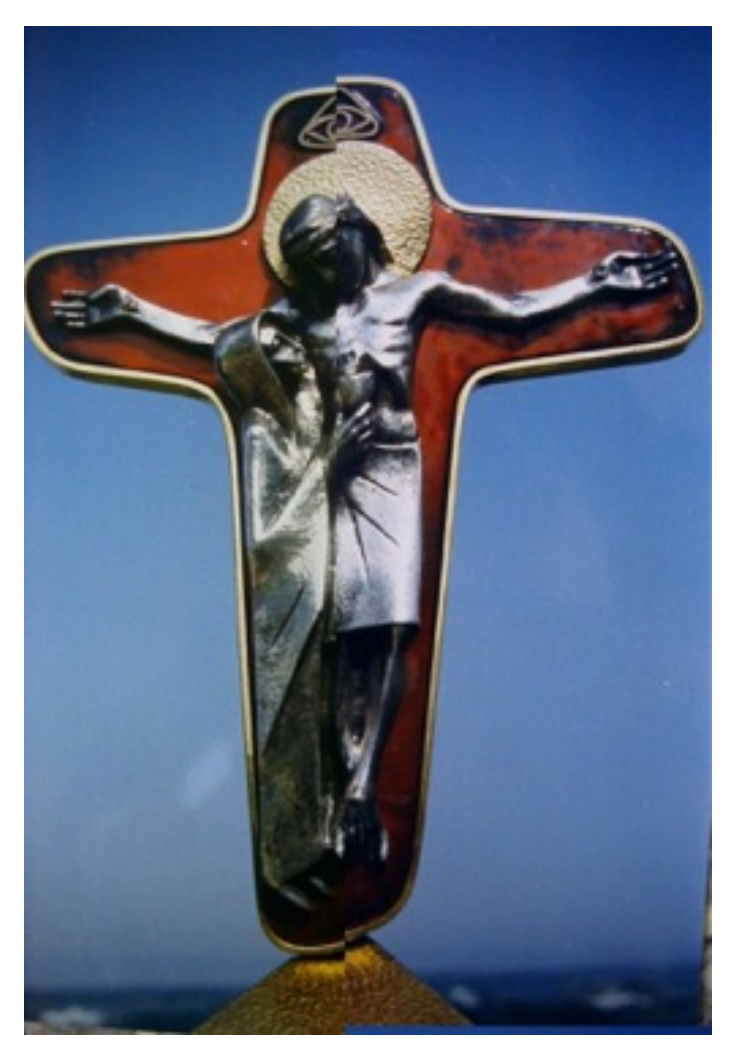
The Unity Cross