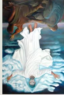
Tabor - When something good happened