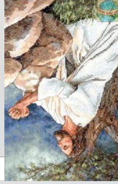
Gethsemane - when something difficult happened